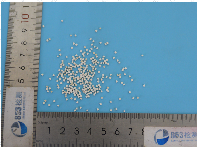
Photo of the sample