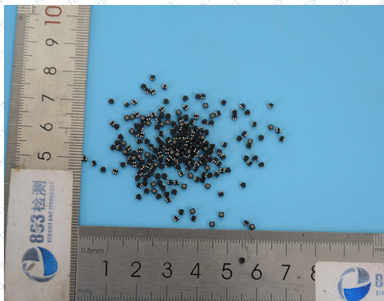
Photo of the sample