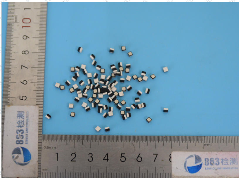
Photo of the sample